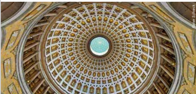
View of the dome with the glass lantern

itects in Germany, whose works (Alte Pinakothek, Ludwigstraße) dominated Munich in the 19th century. Klenze redesigned the Hall of Liberation in a style that reflects both the elegant proportions of ancient temples and the fortified characteristics of medieval towers or temples of the Holy Grail. The inauguration ceremony took place on 18 October 1863, the 50th anniversary of the Battle of the Nations near Leipzig. The Hall of Liberation is built in the shape of an eighteen-sided polygon. The massive supporting buttresses of the façade are crowned by eighteen monumental statues – allegories of the German tribes. The 5.80 m statues were designed by the sculptor Johann Halbig and are made of Danube limestone. The number eighteen also stands for the date of the Battle of the Nations, 18 October 1813, when Napoleon's forces were crushed by the coalition near Leipzig. The interior is dominated by 34 Goddesses of Victory made of white marble, mounted with linked hands on an encircling base. The statues were designed by Ludwig Schwanthaler and symbolise the thirty-four German states of the German Confederation (Deutscher Bund), which was founded in 1815. The coffered ceiling of the 45-metre-high domed hall and the divisions created by the alcoves, arcades and galleries give the room extra-ordinary acoustics, which combine with the architecture and the light, festive colours of the interior to create an appropriately ceremonious atmosphere.