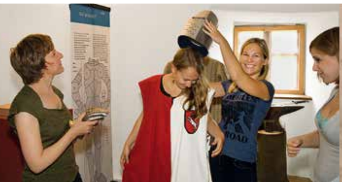
Getting the feel of the Middle Ages