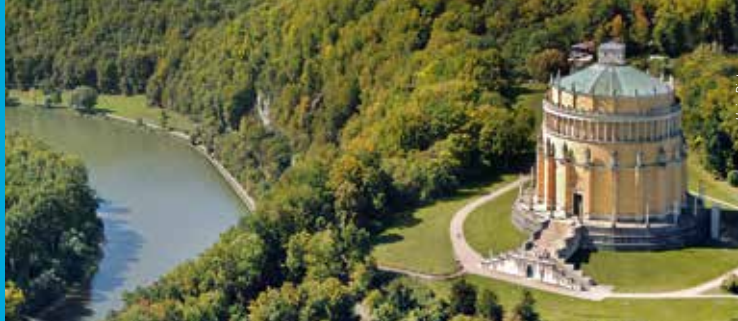
View of the Kelheim Hall of Liberation above the Danube

Bayerischer Staatsminister der Finanzen, für Landesentwicklung und Heimat