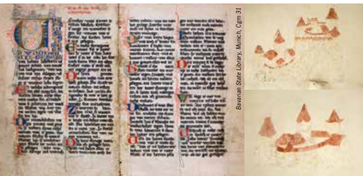
Bavarian State Library, Munich, Cgm 31