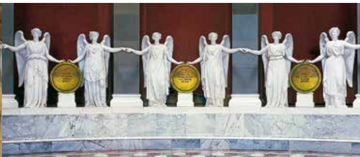
View inside the hall with the Goddesses of Victory

itects in Germany, whose works (Alte Pinakothek, Ludwigstraße) dominated Munich in the 19th century. Klenze redesigned the Hall of Liberation in a style that reflects both the elegant proportions of ancient temples and the fortified characteristics of medieval towers or temples of the Holy Grail. The inauguration ceremony took place on 18 October 1863, the 50th anniversary of the Battle of the Nations near Leipzig. The Hall of Liberation is built in the shape of an eighteen-sided polygon. The massive supporting buttresses of the façade are crowned by eighteen monumental statues – allegories of the German tribes. The 5.80 m statues were designed by the sculptor Johann Halbig and are made of Danube limestone. The number eighteen also stands for the date of the Battle of the Nations, 18 October 1813, when Napoleon's forces were crushed by the coalition near Leipzig. The interior is dominated by 34 Goddesses of Victory made of white marble, mounted with linked hands on an encircling base. The statues were designed by Ludwig Schwanthaler and symbolise the thirty-four German states of the German Confederation (Deutscher Bund), which was founded in 1815. The coffered ceiling of the 45-metre-high domed hall and the divisions created by the alcoves, arcades and galleries give the room extra-ordinary acoustics, which combine with the architecture and the light, festive colours of the interior to create an appropriately ceremonious atmosphere.